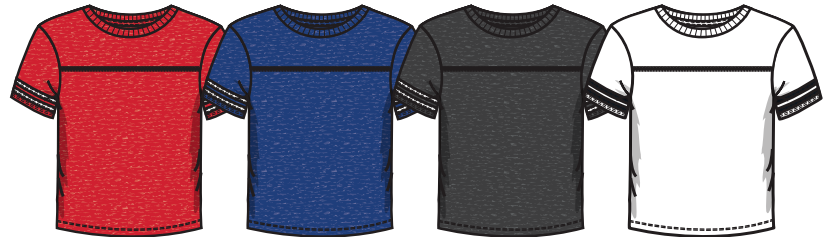
VINTAGE RED/ BLENDED WHITE